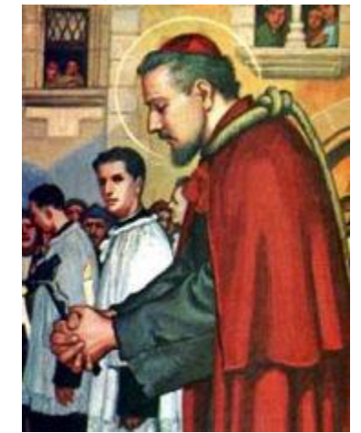
November 4 Patron of Seminarians and Catechists

Oh God, Maintain in your people that spirit with which you inspired your Bishop St. Charles, so that your church may be constantly renewed, conforming itself to Christ and manifesting Christ to the world.